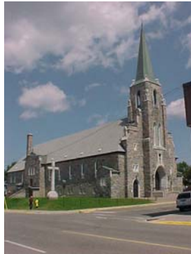
Saint Anthony of Padua Cathedral

For the thousands of people who visit annually, Timmins Memorial Cemetery represents many different things. For some, it is a chance to walk among headstones that chronicle our mining history; for many, it is an opportunity to remember and honour the nation's war heroes, and for others, it is a place to say a last farewell during funeral services for a family member or friend. The following is a compilation of dates and historical facts on the cemetery.