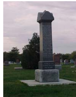
Hollinger Victims Memorial